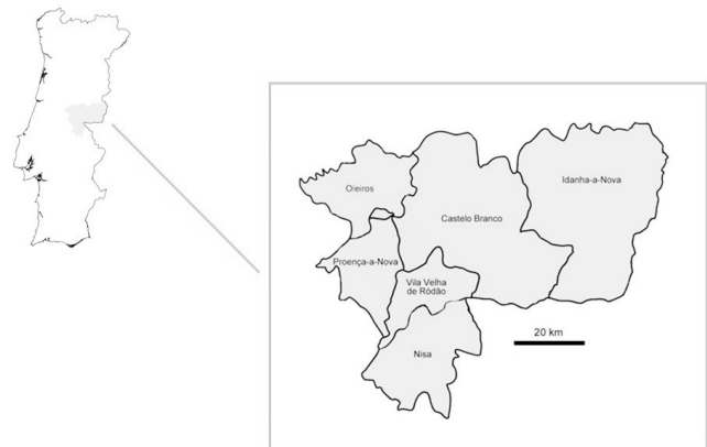
Figure 1: Location and composition of the geopark's territory

Note: Due to the recent rearrangement of the territory with Penamacor's municipality new entry (September 2015), the map does not include this new area. Penamacor municipality is located on the north of Idanha-a-Nova municipality